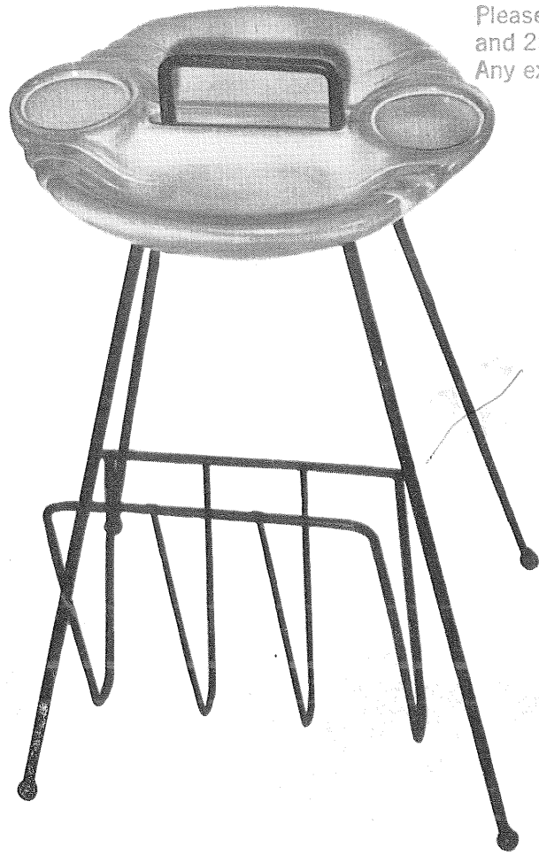
36M—With magazine rack, as shown . . . . . $7.50 34M—Same with square tray . . . . . $7.50

Hess Bros. National Contest for Versatility in Design and Use